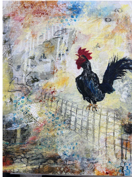
Farm Life Series: Pretty Boy 14 W 18 H Mixed media $400