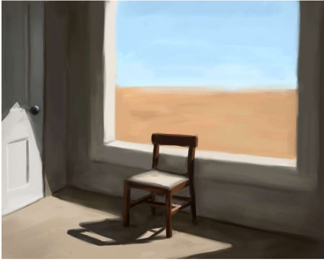
Therapy 10 x 8 inches Digital NFS