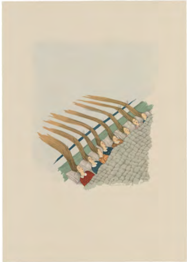
Amy Cutler | Provisions Lithograph | 34½ x 24½ inches | edition 34 | 2008 © Amy Cutler / Universal Limited Art Editions