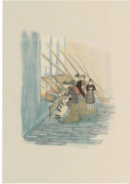
Amy Cutler | Weavers Lithograph | 34½ x 24½ inches | edition 34 | 2008 © Amy Cutler / Universal Limited Art Editions