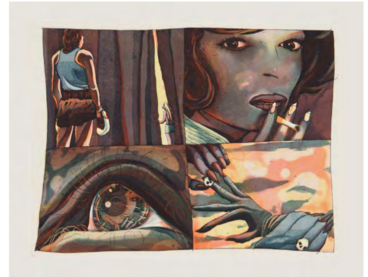
Jonathan Thomas | The Curtain Etching | 16 x 14 inches | 2017