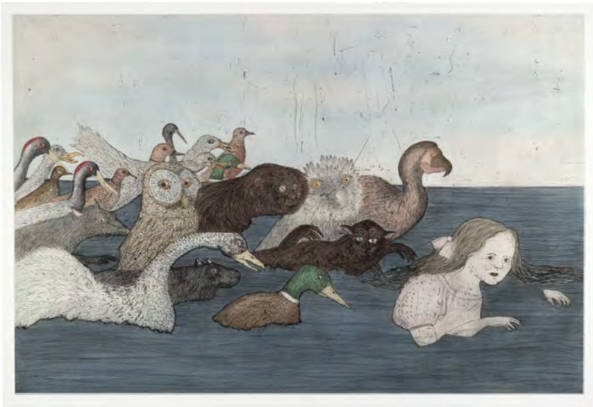
Kiki Smith | Pool of Tears II Intaglio with chine collé | 22 x 24¾ inches | edition 30 | 2000

Largely self-taught, Kiki Smith briefly attended the Hartford Art School before moving to New York in 1976. Solo exhibitions of her work were mounted by the Hirshhorn Museum and Sculpture Garden, Washington DC and the Museum of Modern Art, New York City. In 2006, TIME magazine named Smith one of the “TIME 100: People Who Shape Our World.” Other accolades include the Skowhegan Medal for Sculpture (2000), the Athena Award for Excellence in Printmaking (2005), the Edward MacDowell Medal (2009), Nelson A. Rockefeller Award (2010) and U.S. Department of State Medal of Arts (2012). Her work is in distinguished collections such as the Museum of Modern Art, NY; Metropolitan Museum of Art, NY and the Museum of Contemporary Art, CA.