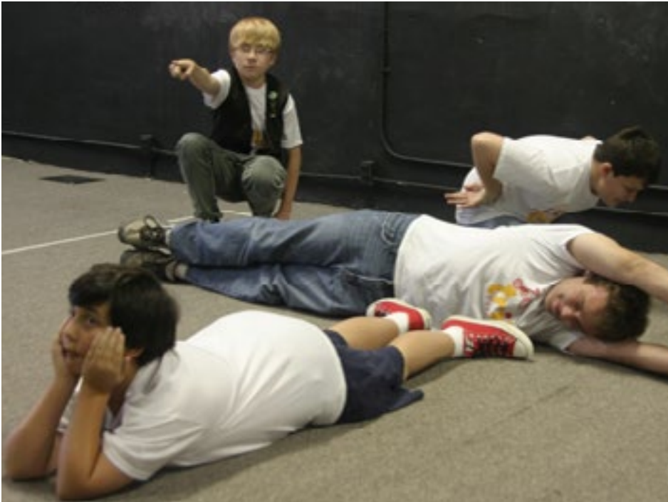
Tricycle Theatre for Youth actors depict the inner dialogue of a person to express his individual experience, belief or perception.