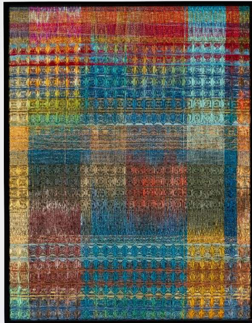
Red Sky in the Morning