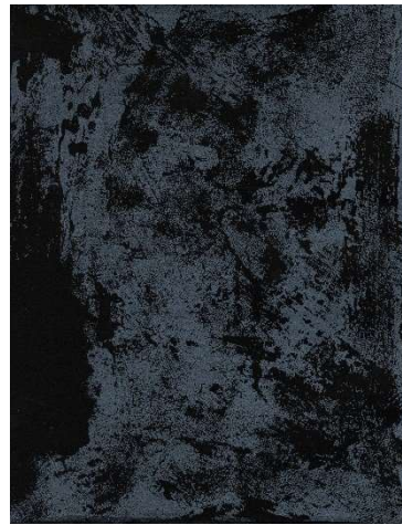
Internal Webbing 12x13in Lithograph Print $388