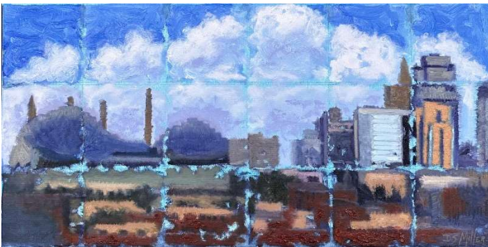
KC 24x12 Oil $900