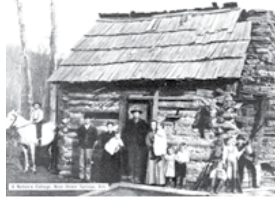
Log cabin, near Heber Springs, 1910s. Photograph by Gray. Courtesy Shiloh Museum of Ozark History / Bob Besom Collection (S-83-87-11)