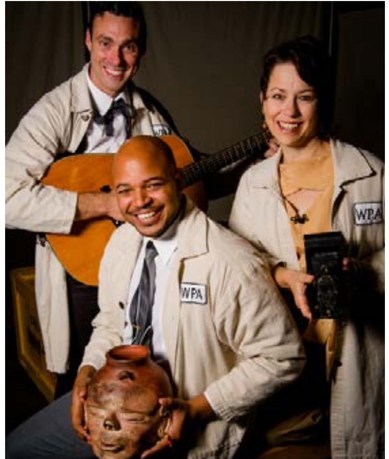
Walton Arts Center, with support from the Arkansas Arts Council, commissioned Trike Theatre, Northwest Arkansas' professional theatre for youth, to create Digging Up Arkansas .