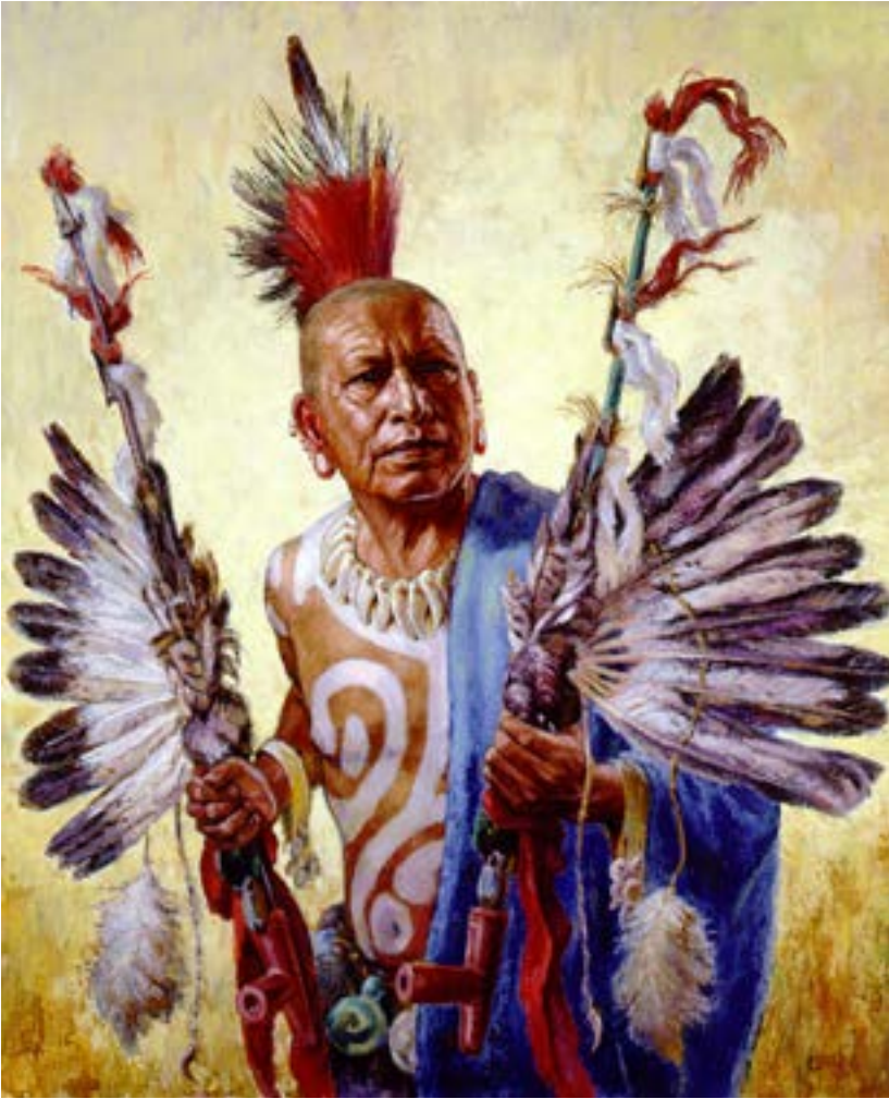
The Quapaw , by Charles Banks Wilson. Used with permission of the artist.