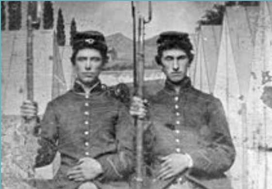
Civil War Union soldiers, perhaps from Wisconsin, early 1860s. Courtesy Shiloh Museum of Ozark History / Delia Mattison Collection (S-87-179-2B)