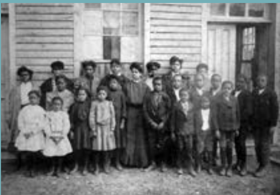
Bentonville Colored School, Bentonville, 1909. (S-95-7-20)