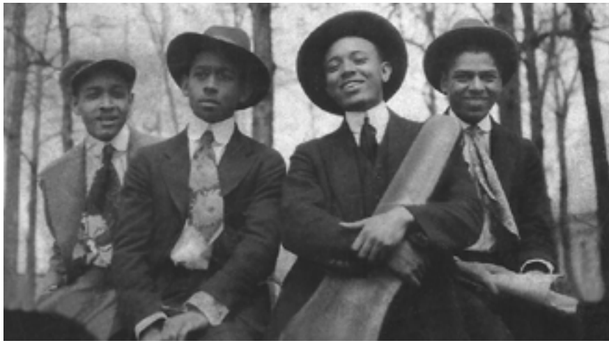
William Grant Still with school friends at Wilberforce University, Ohio, ca. 1915.

Arkansas is a place where influential musicians and song writers lived and worked. Composer, William Grant Still (second from right) grew up in Little Rock, Arkansas. He composed over 150 works including symphonies and popular songs. In 1936, Still conducted the Los Angeles Philharmonic performance of one of his works at the Hollywood Bowl.